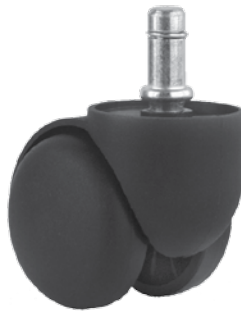
2TW50E4500 50 MM, Euro Style 45MM Neck Grip Ring Stem: 7/16" x 7/8" Steel Ring, Bulk Pack