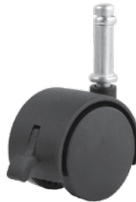
2TW5000022 50 MM, Hooded Grip Ring Stem 7/16" x 1.5" Brake, Brass Band, Bulk Pack