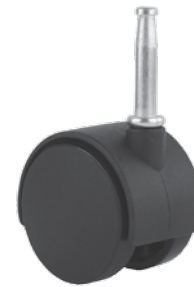
2TW5000004 50 MM, Hooded Socket Stem 5/16" x 1.5"