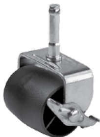
9000000489 Bed Frame Caster 2" X 2-1/4", PP Wheel Grip Neck Socket Stem, 3/8" x 1-5/8" Yellow Zinc Plated Brake