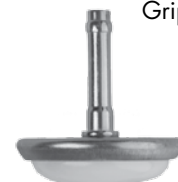
9000000471 2-1/4" Glide Yellow Zinc Plated 3/8" x 1-1/2" Grip Neck Stem