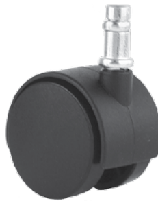
2TW5000001 50 MM, Hooded Grip Ring Stem 7/16" x 7/8" Brass Band, Nylon, 5 Pack