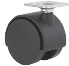
2TW5000005 50 MM, Hooded Top Plate: 1.5" x 1.5" Nylon, Bulk Pack