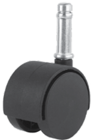
2TW5000002 50 MM, Hooded Grip Ring Stem 7/16" x 1.5" Brass Band, Nylon, 5 Pack