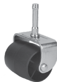
9000000466 Bed Frame Caster 2" X 2-1/4", PP Wheel Grip Neck Socket Stem, 3/8" x 1-5/8" Yellow Zinc Plated