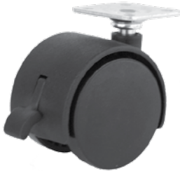
2TW5000006 50 MM, Hooded Top Plate: 1.5" x 1.5" Brake, Nylon Bulk Pack