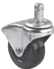
7140213001 Soft Rubber Wheel 2" x 13/16" Hooded, 7/16" x 7/8" Grip Ring Stem, Steel Band