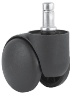
2TW50E3801 50 MM, Euro Style 38MM Neck Grip Ring Stem: 7/16" x 7/8" Steel Ring, Bulk Pack