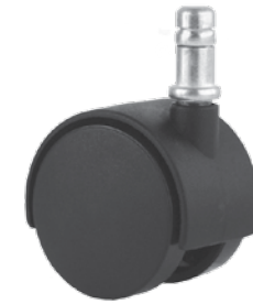
2TW5000007 50 MM, Hooded Grip Ring Stem 7/16" x 7/8" Brass Band, Nylon Bulk Pack